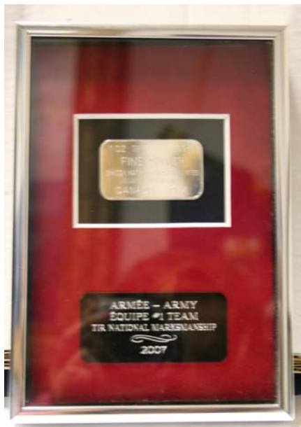
Sample of the keeper plaque (shadow box) and the silver bar.

This trophy was re-introduced at the National Marksmanship Competitions in 2006 for the top Army Cadet team.